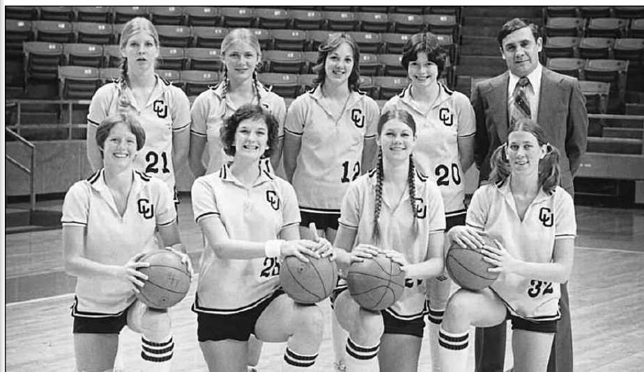
Colorado's 1977-78 team was its winningest to date, with an 18-14 mark.

of the most formidable women's basketball conferences in the country.